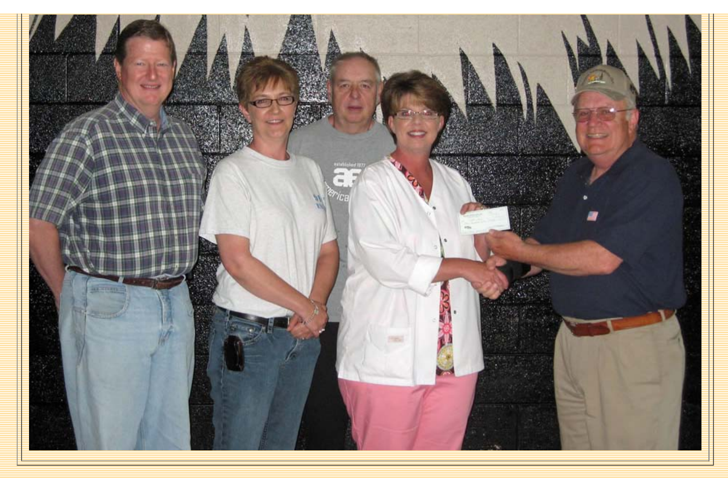
RARC Concludes Second Technician Class Course with Seven New Licensees